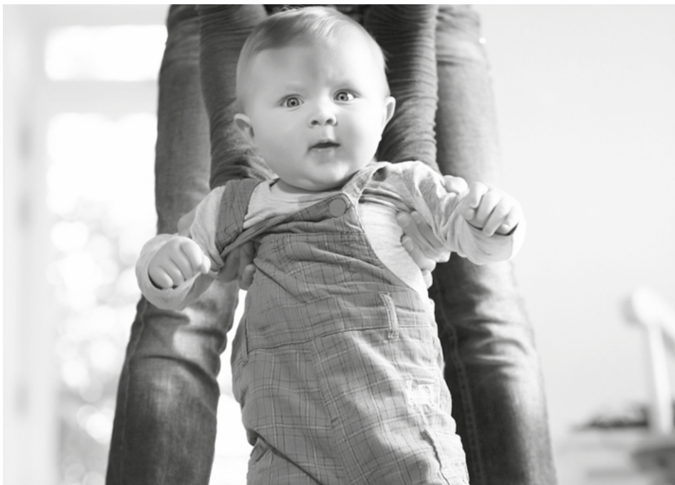
Reaching, failing and reaching again is a common thread of deep practice.

Myelin builds a better, faster brain and a better, faster business too.