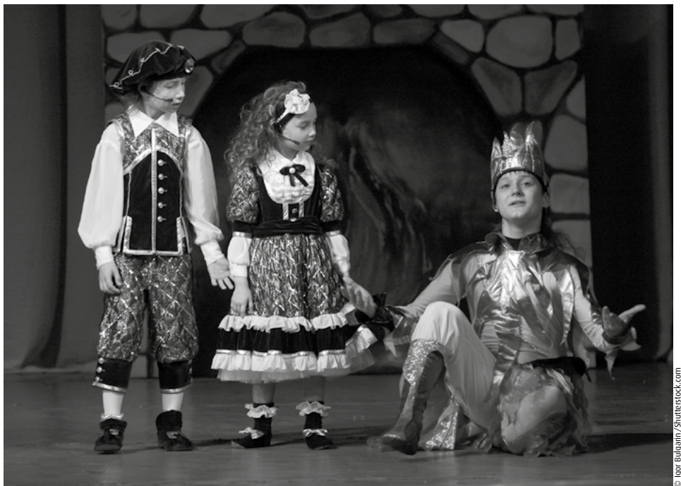
More than 2 or 3 actors on stage and your business brain fails you.

David suggests a brilliant way to look at your 4% is to see it as a very small stage where your thoughts are the actors - for example: