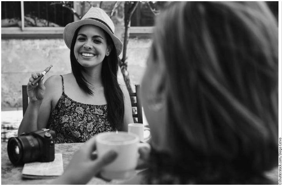
Vaping and coffee, habit-forming products hook into habitual behaviours

You'll find more on these four triggers and the five sources of habit triggers in the online tools and resources – click the button on the page opposite .