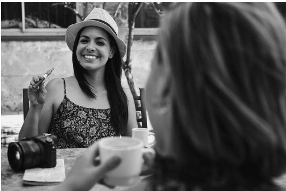
Vaping and coffee, habit-forming products hook into habitual behaviours

You'll find more on these four triggers and the five sources of habit triggers in the online tools and resources – click the button on the page opposite .