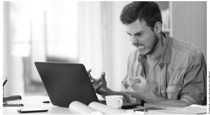
...irrelevant emails will be seen by your customers as the evil arch-enemy called spam!