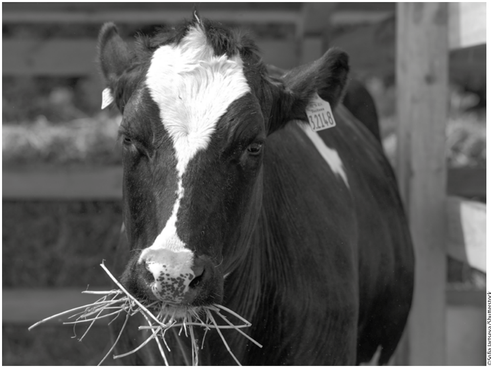
Asking your customers to 'chew their cud' twice drives future disloyalty

who takes the call deals with the call, if not ensure they pass on all the information to the next person.