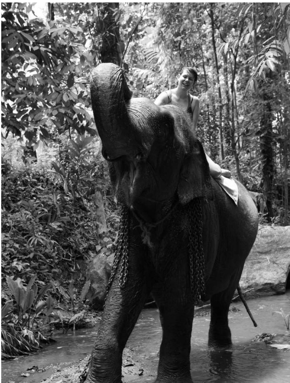
Change works when you...direct the rider, motivate the elephant and shape the path.

For insightful stories on each of these elements, check out the downloadable tools and resources for this edition of Business Bitesize.