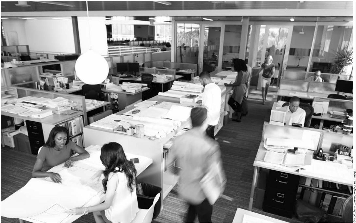
80/20 thinking turns office carpet industry on its head