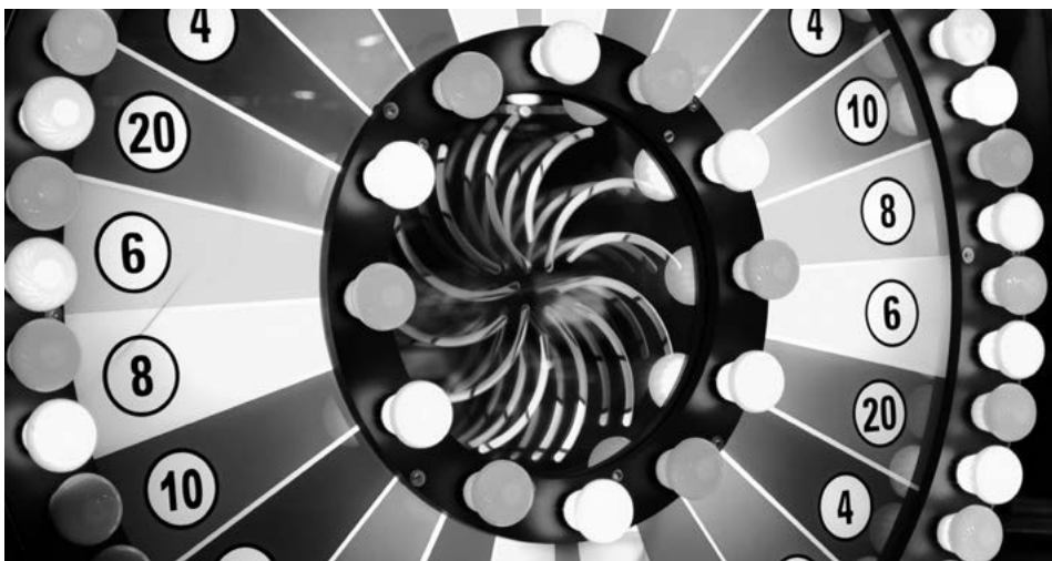
Wheel of fortune as a pricing anchor almost always works...

In the first test 4 out of 5 people chose the premium beer option (at £2.50) and produced £236 for every 100 buyers.