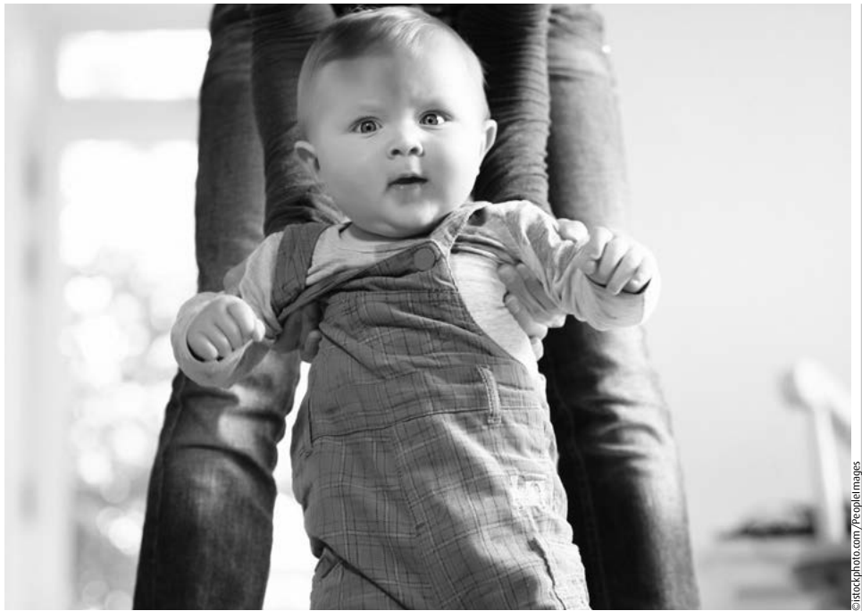
Reaching, failing and reaching again is a common thread of deep practice.

Myelin builds a better, faster brain and a better, faster business too.