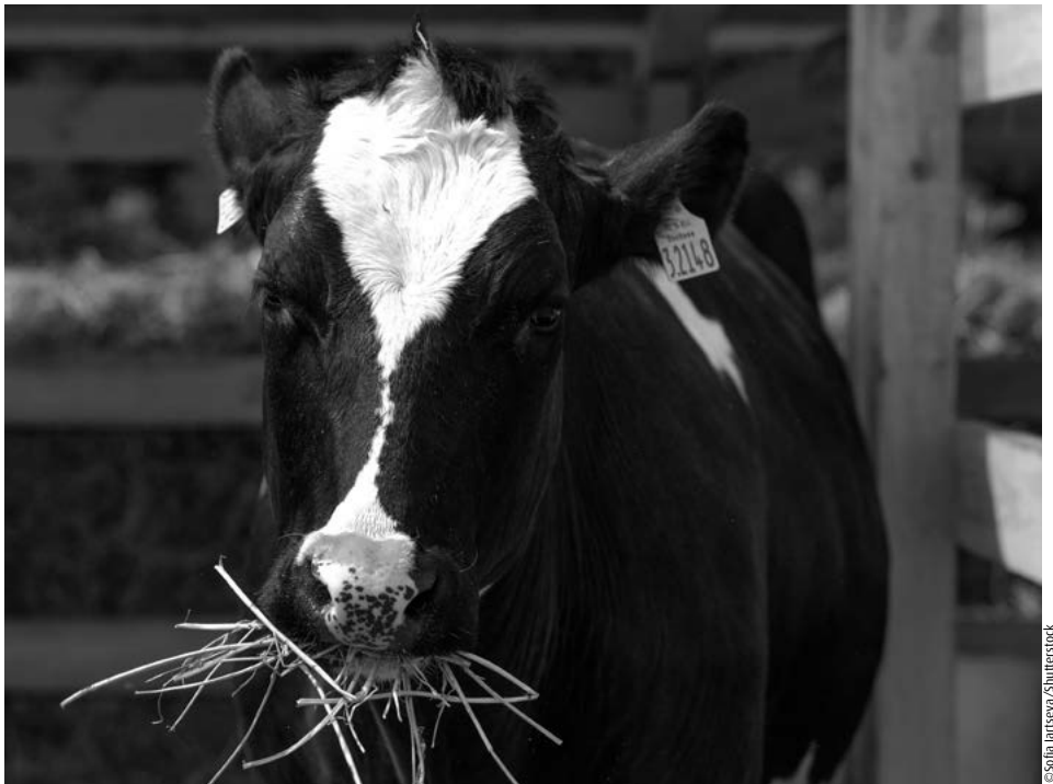
Asking your customers to 'chew their cud' twice drives future disloyalty

who takes the call deals with the call, if not ensure they pass on all the information to the next person.