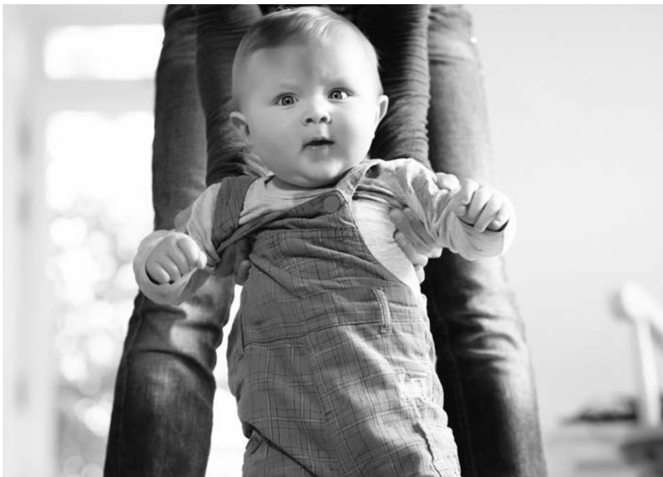
Reaching, failing and reaching again is a common thread of deep practice.

Myelin builds a better, faster brain and a better, faster business too.