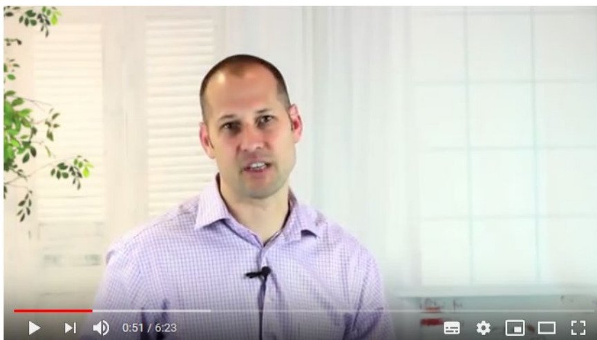
What Street Gangs Can Teach You About Credibility