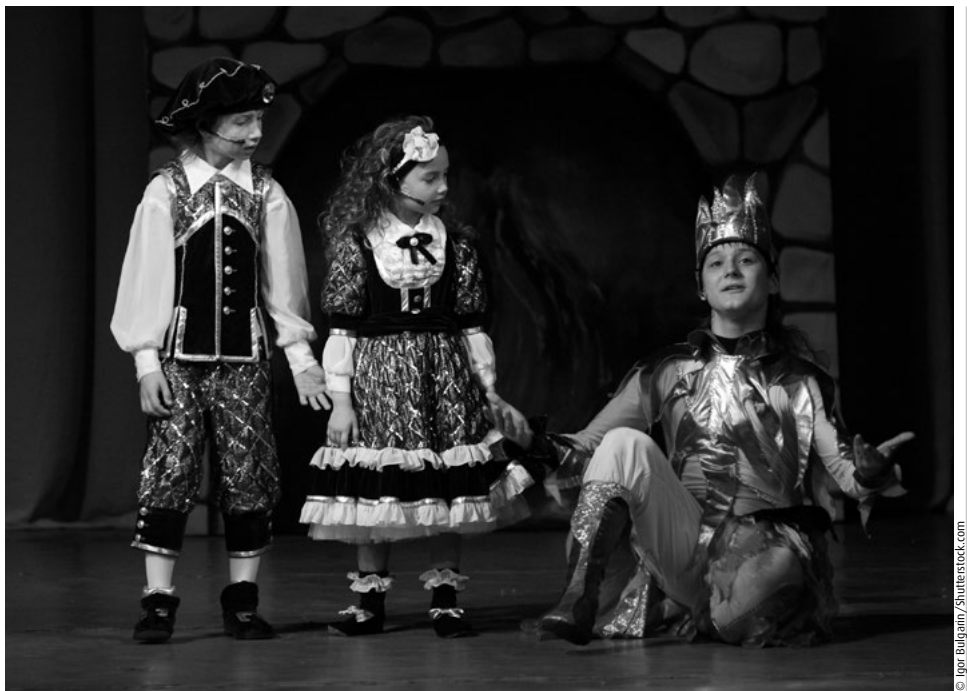
More than 2 or 3 actors on stage and your business brain fails you.

Ask a group of children to act out a stage play with no direction or guidance – what